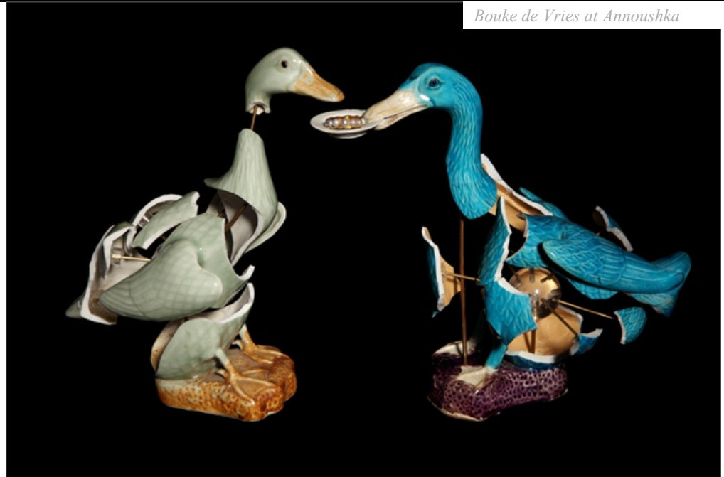
Bouke de Vries at Annoushka